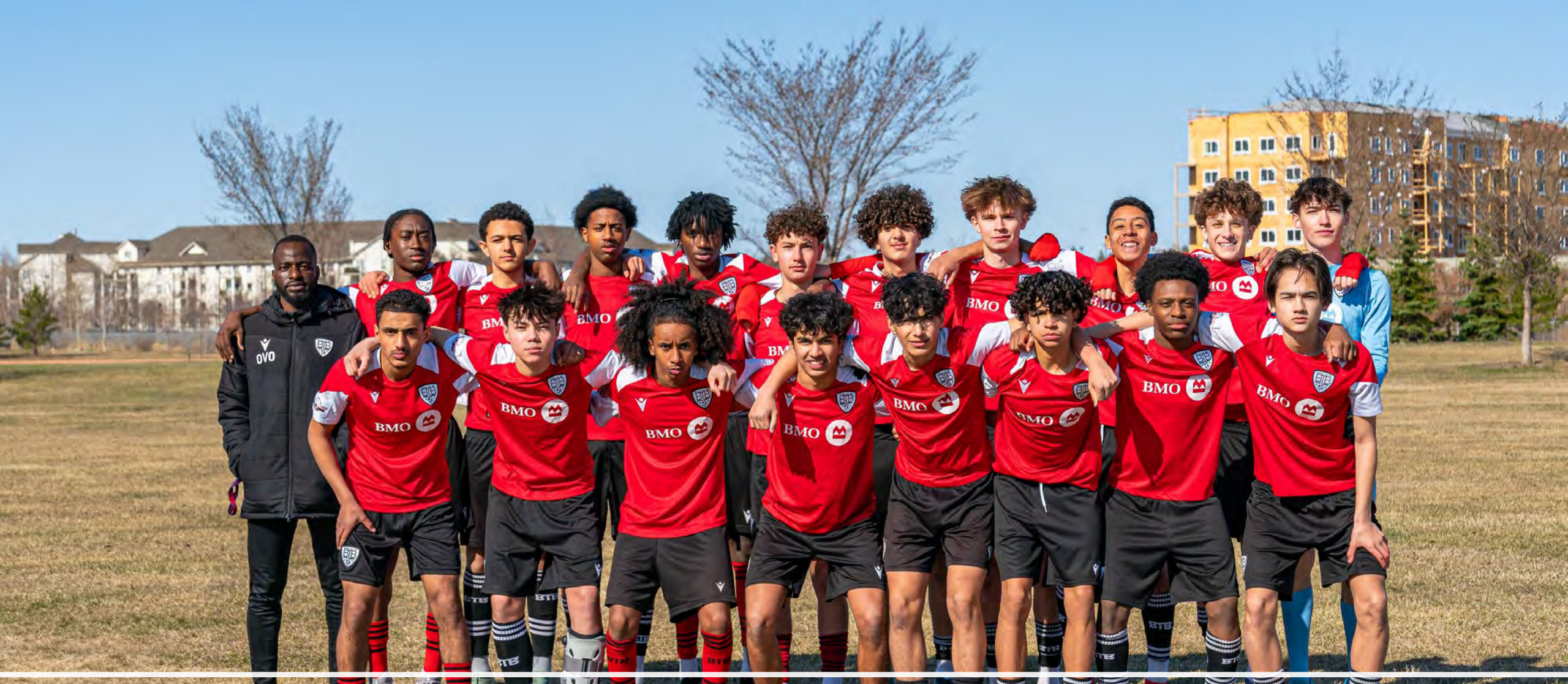
EMSA T1 & T2 PROGRAMS INDOOR 2025-2026